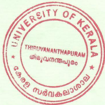
Signature with seal (Registrar)