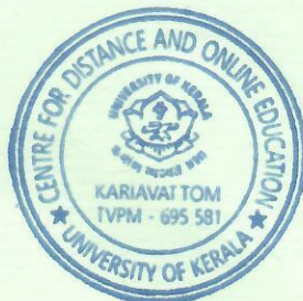
Signature with seal (Director of CDOE)