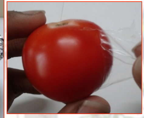
Edible film formed from the suspension mixture